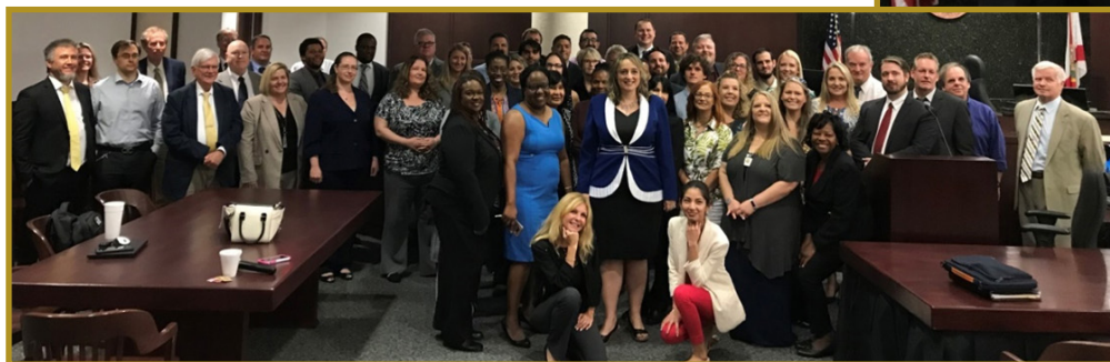
Attendees from the Office of Criminal Conflict and Civil Regional Counsel, 2nd District