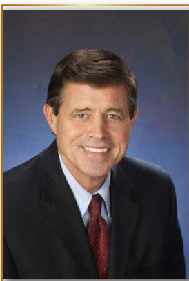
JUDGE WILLIAM MATTHEWMAN